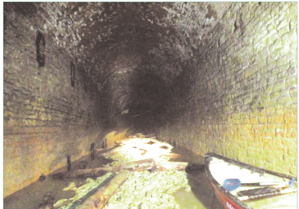
Below: Wood beams to the west of the central fall area