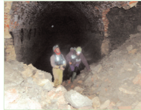
Above: Breach of both walls looking north

We walked along the tunnel to the point where it enters the second limestone section at about chain 102. At this point, the bottom becomes lower and is covered by a very thick and sticky layer of puddle clay making further progress extremely difficult. The decision was made to turn back,