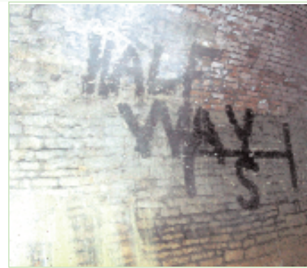
Above: A clue to the location can be found painted on the wall